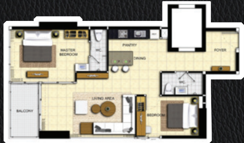
Type H 65 sqm