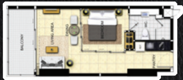
Type B 49 sqm