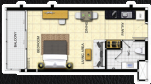
Type C 43 sqm