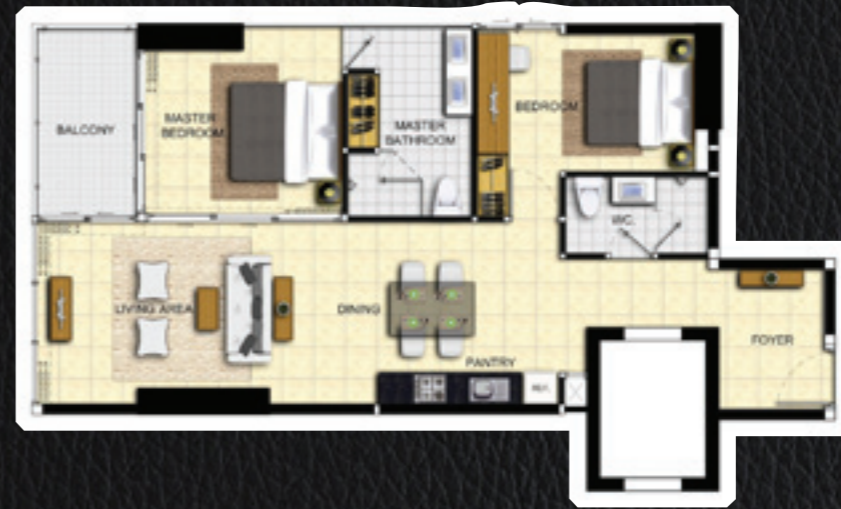
Type E 40 sqm